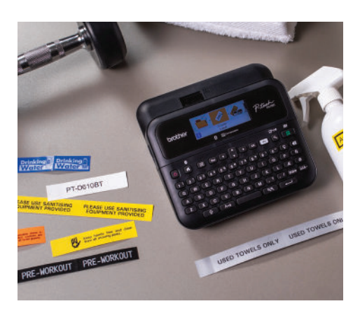
Over 170 different label templates to choose from