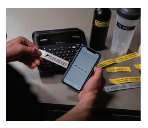
Print from your smartphone via Bluetooth