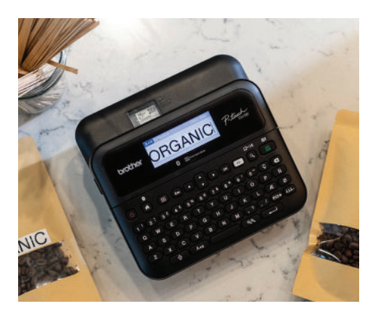
High resolution LCD display