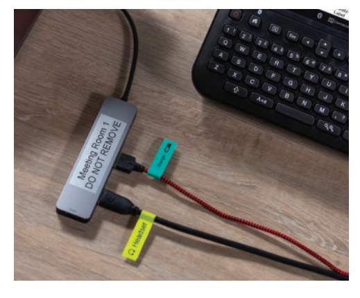
Cable labelling function