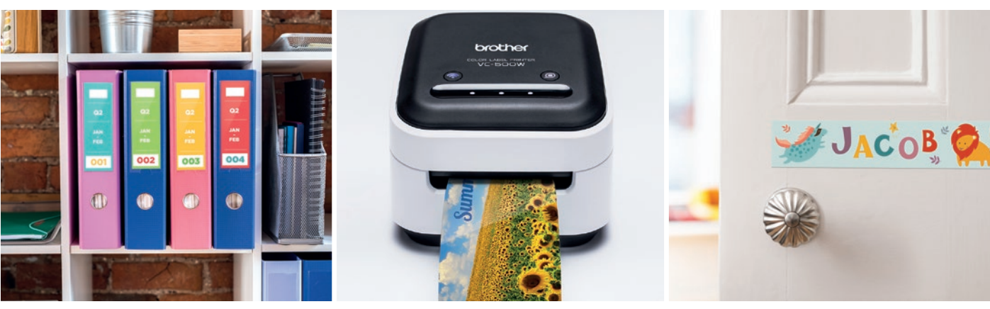
Office Photos Home