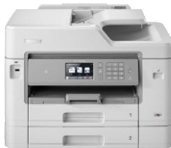
Business Inkjet Devices