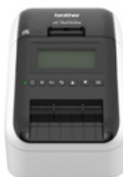
Professional QL Labellers