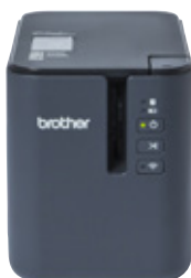
High-Volume Office Labellers