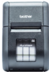
Rugged Receipt and Label Printers