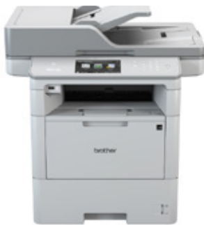
Professional Monochrome Laser Devices