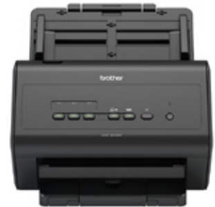
Business Document Scanners